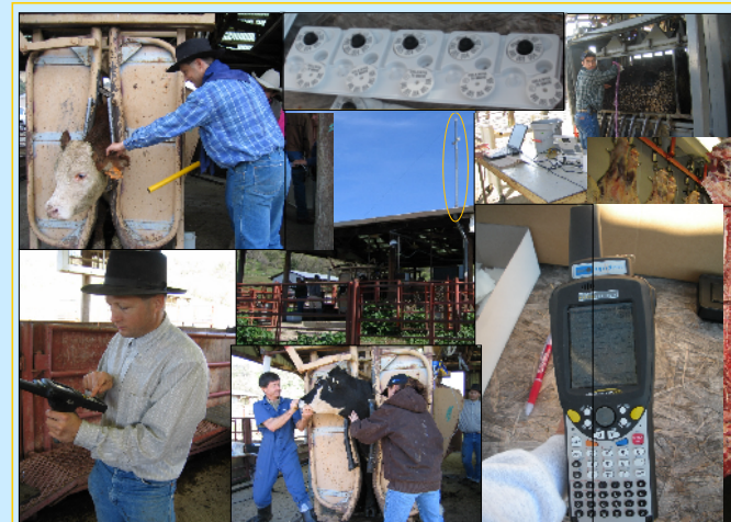
Representative data on a randomly-selected calf from the 2007 UC Davis cow-calf herd. Double-headed arrows represent two-way exchange.